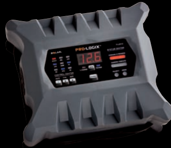
PL2510 6/12V 10/6/2 Amp Intelligent Battery Charger/Maintainer with Engine Start